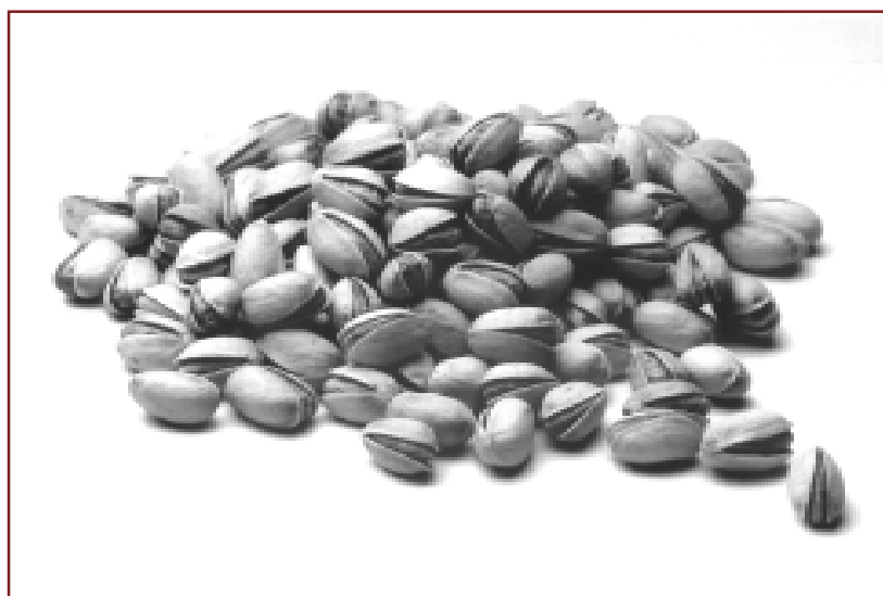
Sirora nuts from the 1997 season. Characteristics of this variety are that the nuts are light in colour, show even splitting and have a good flavour.