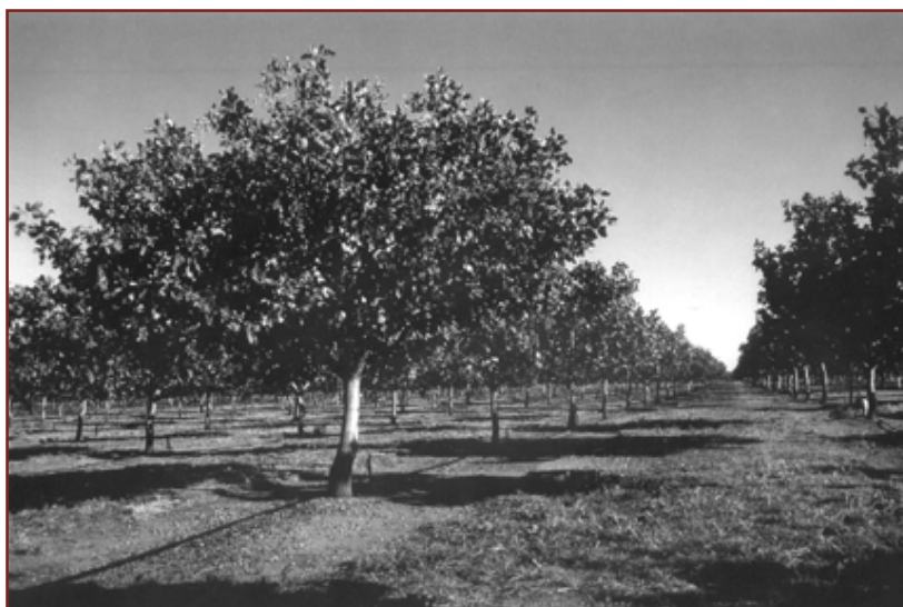
Australian pistachio orchard showing formal tree shape needed to allow access for mechanical harvesting.

The manager of a pistachio orchard should have a good knowledge of the production requirements of deciduous tree fruit or nut crops, together with a high degree of adaptability, because there are some aspects of the management of pistachio that require slightly different approaches. Special knowledge of tree training is absolutely critical in both the establishment and the production phases of the crop, and a potential grower should become familiar with the standard industry practice.