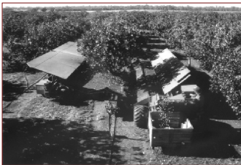
Mechanical harvesting of pistachio in the Murray Valley

A range of different levels of sophistication in handling, packaging and storage exists in the industry which may be related to the scale of the orchard. Some growers handle and pack their own crop with simple equipment and there are processors that provide a hulling, drying and sorting service on a contract basis.